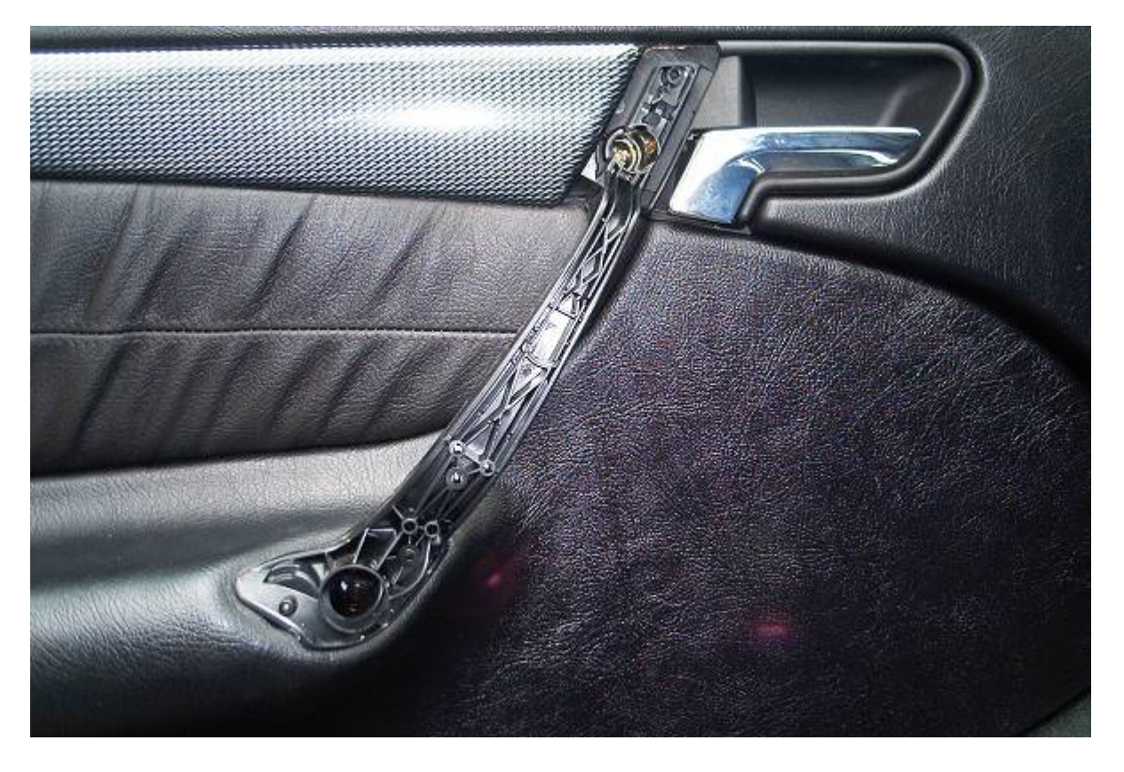
take the screw off the plastic piece around the lock end of the door: