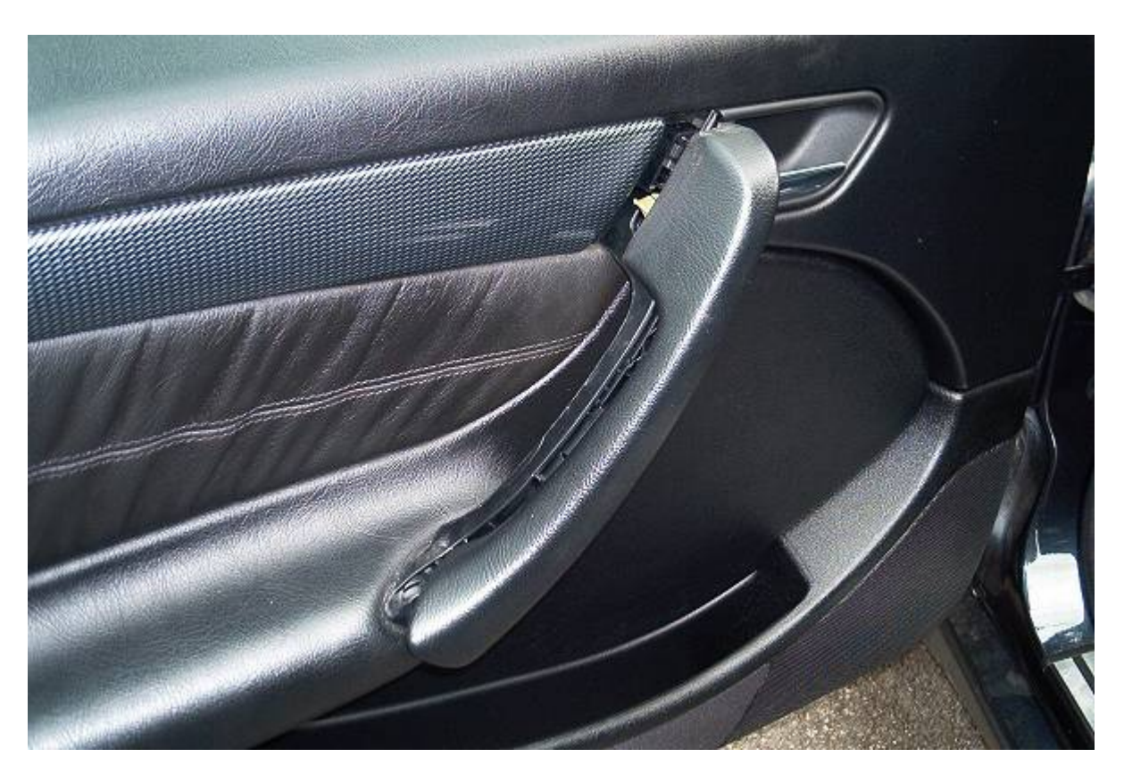
Behind that is two more screws, top and bottom, take them out: