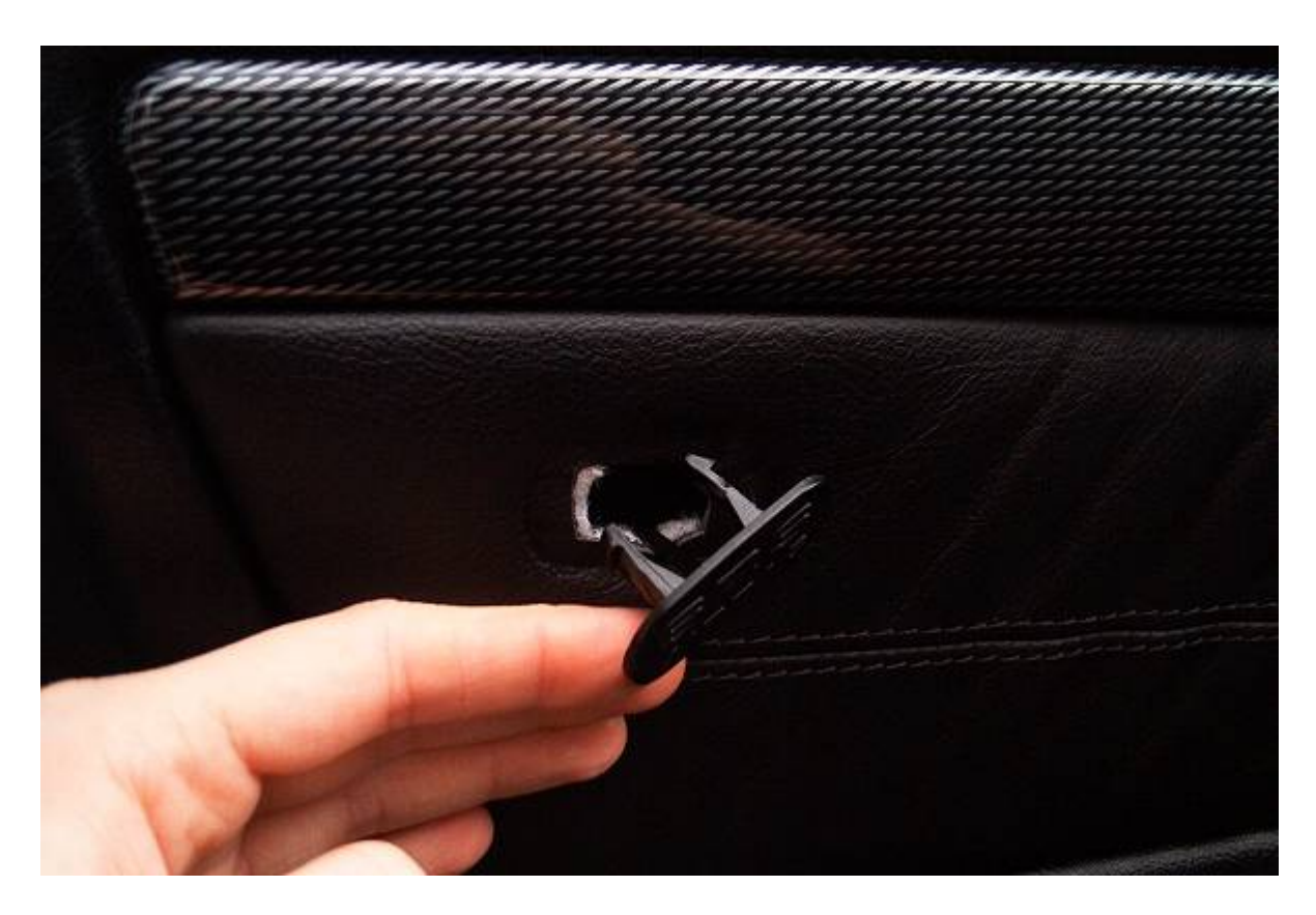
take out the screw behind it: